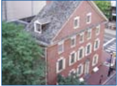
3 DECLARATION HOUSE Where Thomas Jefferson wrote The Declaration of Independence