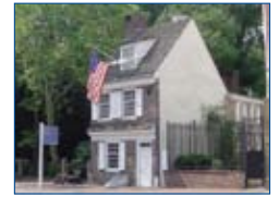
18 BETSY ROSS HOUSE Where Betsy Ross sewed the first Stars and Stripes