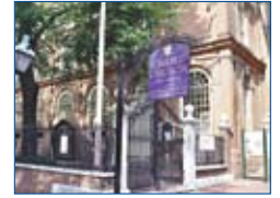
17 CHRIST CHURCH An active parish since 1695, often called the "Nation's Church"