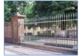
20 CHRIST CHURCH BURIAL GROUND The final resting place of Benjamin Franklin