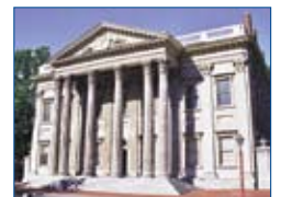
15 THE FIRST BANK OF THE UNITED STATES Sparked the first great Constitutional debate