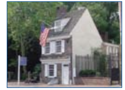
18 BETSY ROSS HOUSE Where Betsy Ross sewed the first Stars and Stripes