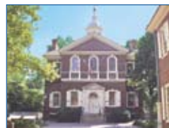
13 CARPENTERS' HALL The birthplace of the American identity