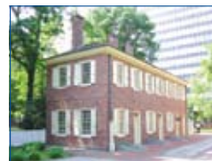
14 NEW HALL MILITARY MUSEUM Interpreting the role of the military in early U.S. history