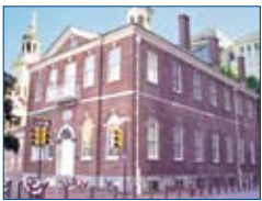
7 CONGRESS HALL The former U.S. Capitol and site of two Presidential Inaugurations