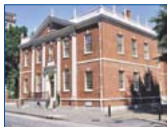
11 LIBRARY HALL The nation's first public library and the former Library of Congress