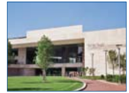
21 NATIONAL CONSTITUTION CENTER Exercise your right to explore the Constitution of the U.S.