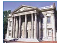
15 THE FIRST BANK OF THE UNITED STATES Sparked the first great Constitutional debate