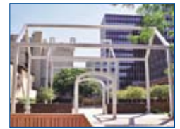
16 FRANKLIN COURT & B. FREE FRANKLIN POST OFFICE Ben Franklin's home and the only Colonial-themed Post Office