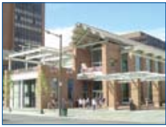
1 INDEPENDENCE VISITOR CENTER Your adventure begins