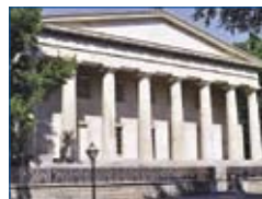
12 SECOND BANK OF THE U.S. One of the most influential financial institutions in the world, now a portrait gallery