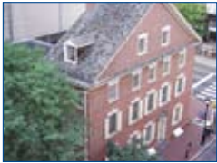
3 DECLARATION HOUSE Where Thomas Jefferson wrote The Declaration of Independence