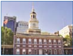
6 INDEPENDENCE HALL America's Birthplace