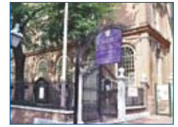
17 CHRIST CHURCH An active parish since 1695, often called the "Nation's Church"