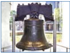
5 THE LIBERTY BELL The quintessential icon of American freedom